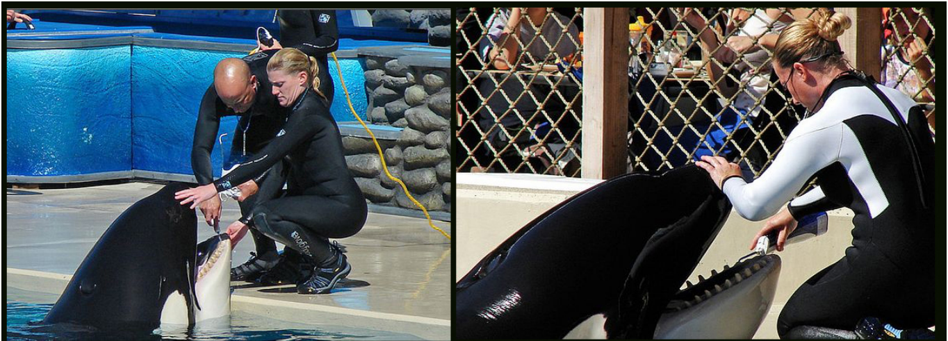
Captive orcas break their teeth on horizontal steel bars and concrete, sometimes exposing the pulp of the tooth. This pulp is drilled out via a modified “pulpotomy.” Subsequently, the animals require lifelong daily teeth flushings to combat food plugging, as these open holes are a direct route for bacteria to enter the bloodstream. Left: Orkid. Right: Sumar (dec. 9/7/2010) Note: The pictured orcas are young, and the mouths shown are in relative good health. The prevalence of broken teeth increases with age. Tilikum, for example, has lost the majority of teeth on the lower jaw. The decimated jaws of captive orcas are a carefully managed topic from a public relations standpoint, with tooth flushing explained to visitors as “superior dental care.”

Veterinary and animal care workers at marine parks are under considerable pressure to keep valuable captive assets, such as orcas, alive. As such, it is common practice to administer on-going prophylactic medications such as those that reduce stomach acid production and block histamine, like Tagamet. Stress-related ulcers are common in captive marine mammals and must be dealt with medically. Similarly, the use of antibiotics is often the immediate response to an animal appearing “off” or “slow,” and at any given time one or more orcas may be receiving antibiotics.