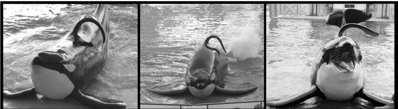
These images of Keto, Tilikum, and Taku (deceased) illustrate dorsal collapse. In the ocean, lateral, torsional, and compressive forces generated by moving water typically sculpt erect dorsal fins. It is known that in humans, healthy connective tissue and muscle and bone will adapt to loading (perhaps at the local gym) by becoming stronger. In all likelihood, these collapsed dorsal fins are caused by increased hours of surface floating (or slow circle-swimming) and a removal of those forces. This process is accentuated in male orcas, whose fins grow much taller than females. Collapsed fins like those above, are very rare in the wild.

In light of Ms. Brancheau's horrific death, the recent focus of public discourse has been on the safety measures in place at marine mammal facilities, and future steps to prevent morbidity and mortality amongst the human keepers of captive orcas. Safety measures aside, the objective of this article is to identify several key issues related to the whales themselves. It is our hope that a more holistic understanding of orcas within captive environments may lead to better judgments by park managers, the public, and regulatory agencies such as the USDA, APHIS, NOAA, NMFS and the Occupational Safety and Health Administration (OSHA). While parks such as SW should be credited for some of the early research on basic killer whale behavior and physiology, a review of the scientific literature suggests that very little new knowledge is being generated as a result of orca captivity.