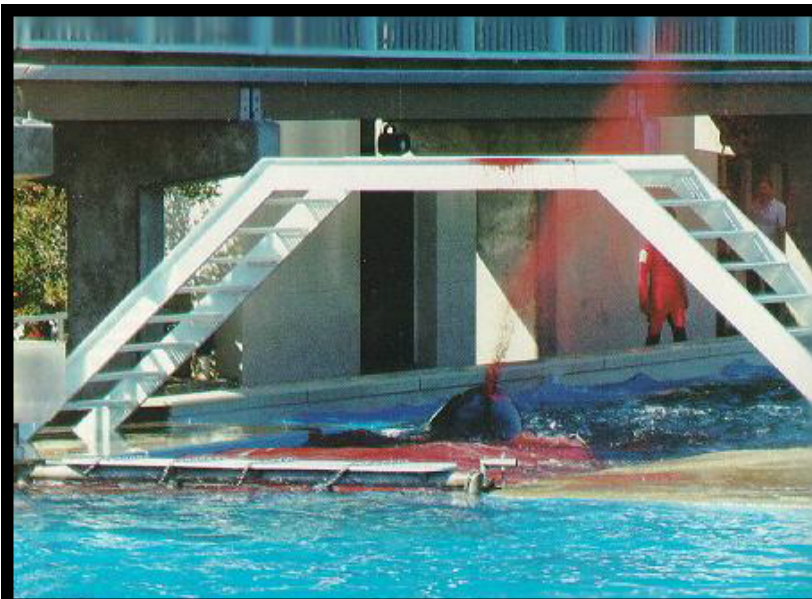
Kanduk V is photographed exhaling blood from her blowhole on 21 August 1989, at Sea World of California.

This self-inflicted injury was sustained as a result of aggression toward Corky, another orca in the social hierarchy.