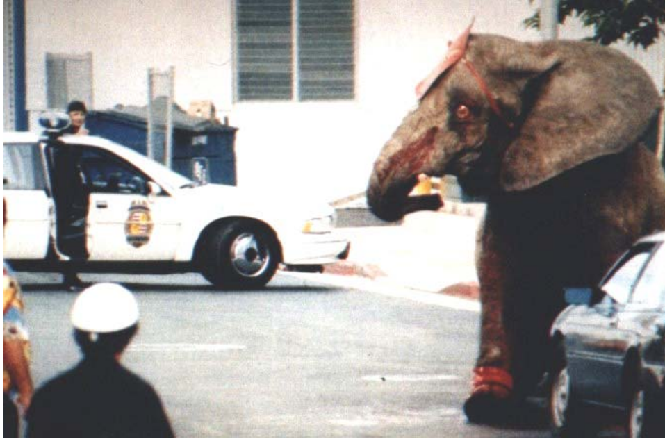
Photo 7 - Shrine Circus

His boss, Alan Campbell, instructs Beckwith to get Tyke - a 9500-pound female African elephant owned and leased by the Hawthorn Corporation – cleaned up for the next show. Beckwith brushes Tyke on her right side, then walks behind the elephant to brush her left side when the elephant apparently spooks.